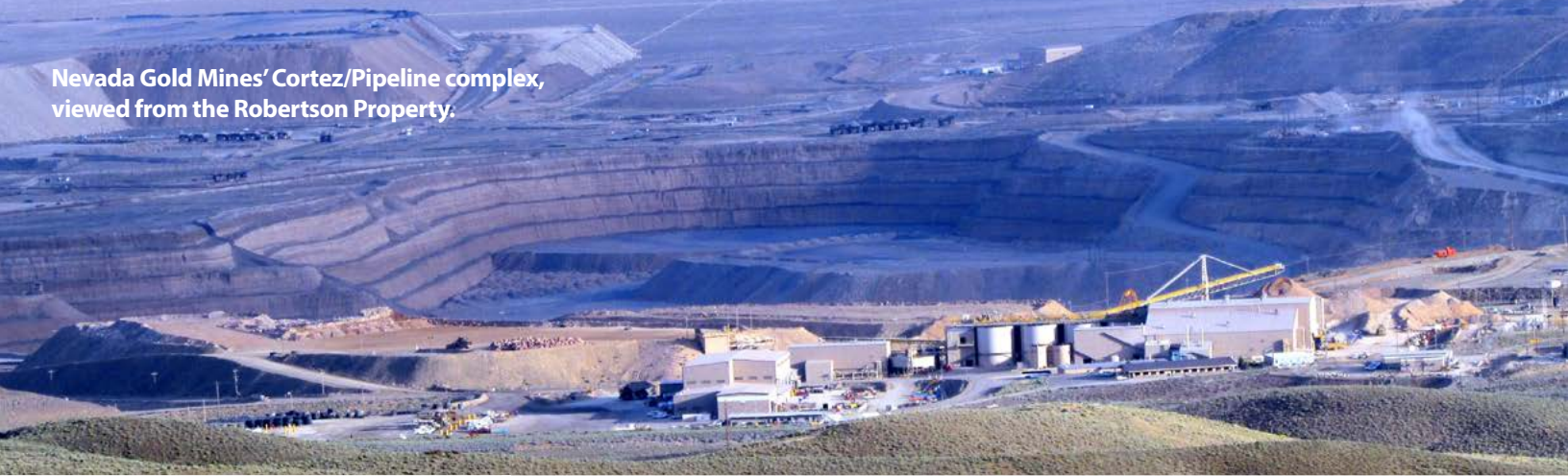
Nevada Gold Mines' Cortez/Pipeline complex, viewed from the Robertson Property.